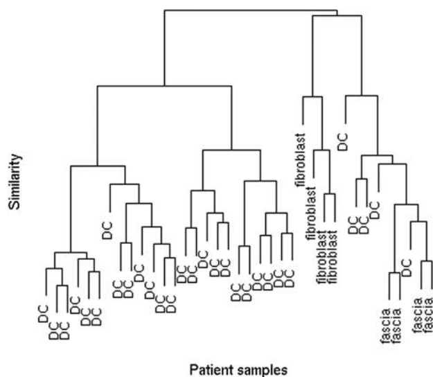
Figure 1 Hierarchical clustering of the samples based on miRNA detection calls. Note that the Dupuytren's contracture patients have a distinct expression profile that separates them from the fibroblast and fascia control samples.

*Indicates the mature miRNA is from the opposite arm of the precursor.